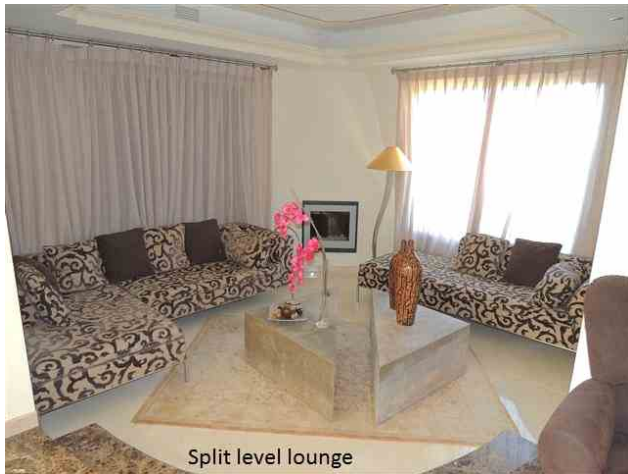
Split level lounge