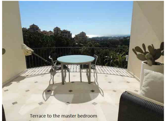
Terrace to the master bedroom