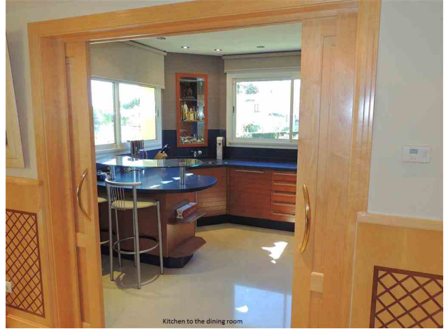
Kitchen to the dining room