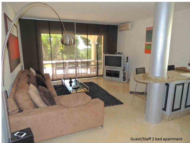
Guest/Staff 2 bed apartment